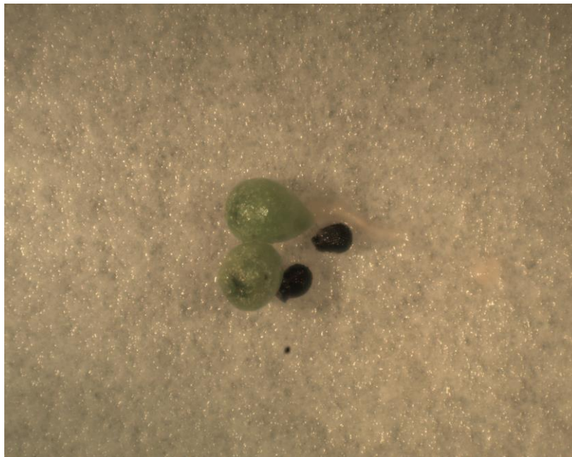
Figure 3. Detail of germination of cryopreserved seeds of Melocactus zehntneri Braun ex Ritter f. after 15 days recovery.

**T0- Control: no cryoprotectants (no glycerol, no PVS2, no Phloroglucinol); T1- PVS2 (10 min), T2- PVS2 + phloroglucinol 1% (10 min); T3- PVS2 + Supercool 1% (10 min); T4- PVS2 + phloroglucinol 1% + Supercool 1% (10 min).