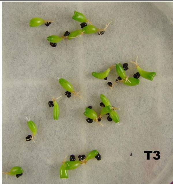
Figure 4. Detail of germination of cryopreserved seeds of Cereus gounellei Luetzelb ex Schum k. after 15 days recovery. The figure shows seeds germinating after cryopreservation under treatment 3, PVS2 + Supercool 1% (10 min).