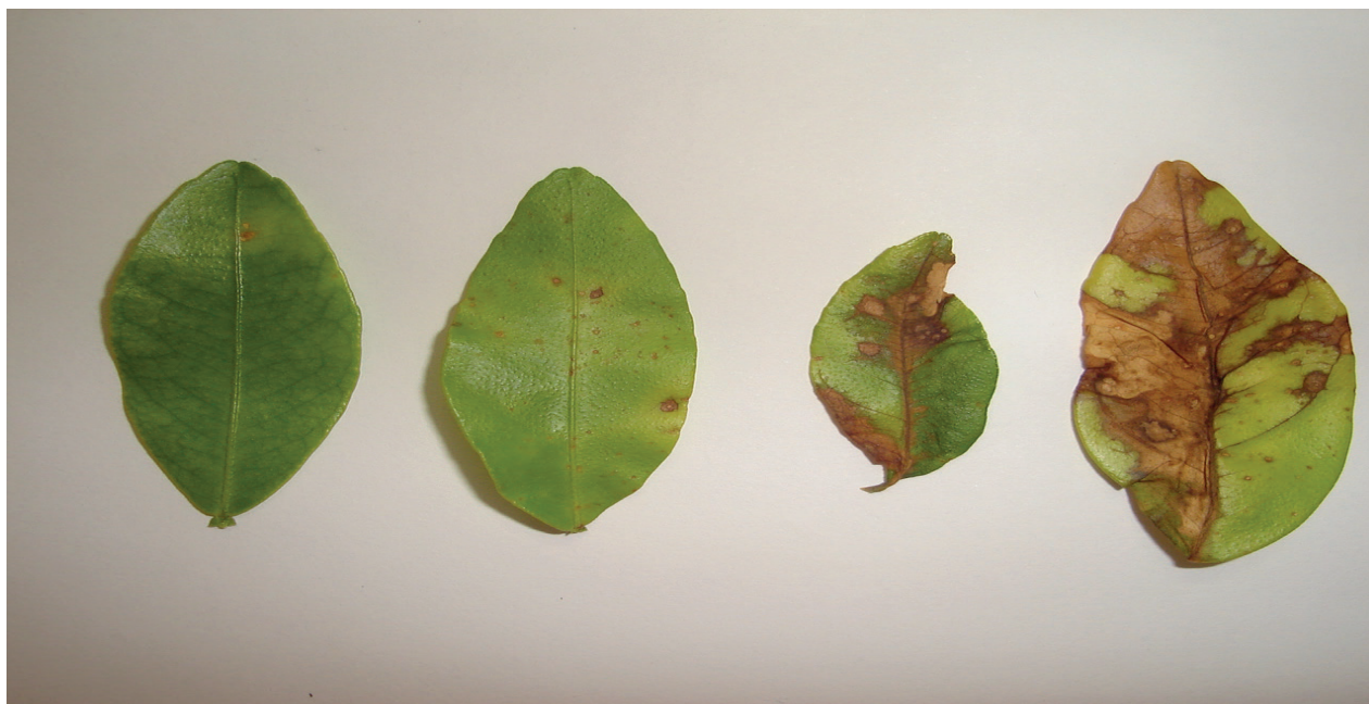
Figure 1. Typical symptoms of alternaria brown spot in Murcott tangor leaves.

To validate the scale, five assessors with no previous experience in assessing the disease determined the percentage of the foliar area lesioned by the A. alternatae , from a total of 100 leaves, with or without the help of the diagrammatic scale. Precision and accuracy were measured by the application of a t-test to the slope (b) and the line intersection value (a) obtained in a linear regression among the severities estimated by each assessor for each stage, with real severity values. Precision was determined by analyzing the line coefficient of determination ( R^2 ) and error distribution of each assessor for each stage (Campbell and Madden 1990).